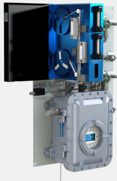
330SDS Standard Sample Conditioning System with Open Deck Lid