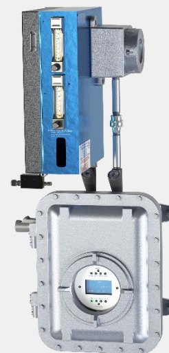
Envent Model 330SDS