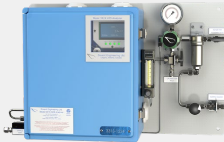
331S H 2 S Analyzer with Standard Sampling System