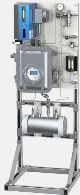
Envent Model 330S with Standard Sample Conditioning and Total Sulfur Oven