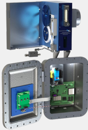
Envent Model 330S Analyzer