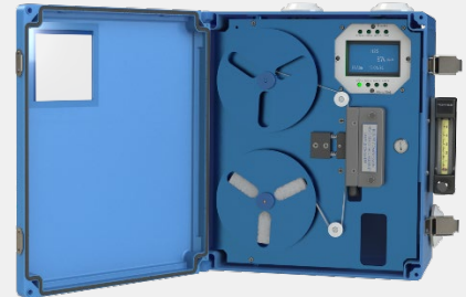
Envent Model 331S H 2 S Analyzer