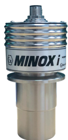
Minox i Intrinsically Safe Oxygen Transmitter