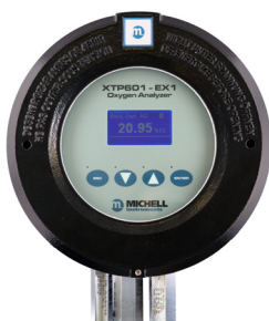
XTP601 Oxygen Analyzer