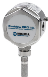
Easidew PRO I.S. Process Dew-Point Transmitter