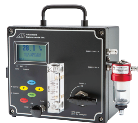
GPR-1200 Portable Trace Oxygen Analyzer